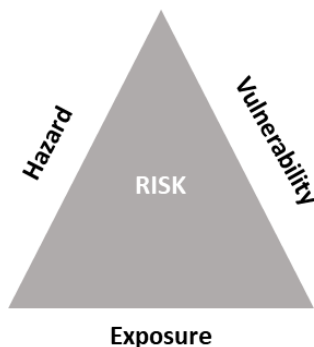
Fig 1. The “risk triangle,” from Crichton (1999).

Risk depends on a combination of the three elements of exposure, hazard, and vulnerability (Fig. 1; Crichton 1999). Based on our current understanding of bats and land-based wind energy development, data indicates the spinning blades are the hazard, migratory tree-bats appear to be the most vulnerable to collisions, and periods of relatively low wind speeds during approximately July through October